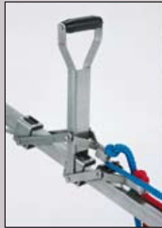
New Alternate traction