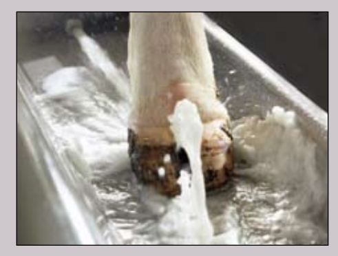
When the cows walk through the channels, the liquid is pumped around in the foot bath and sprayed forcefully against the feet and heel removing contamination from wounds and the interdigital space.

Material: The 3.2 metre foot bath is completely stainless steel