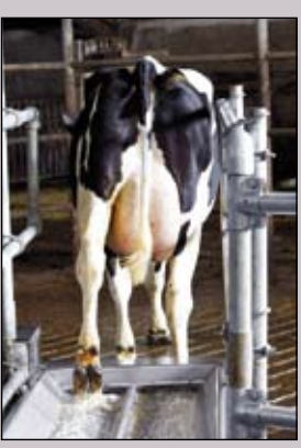
The cows quickly become familiar with the tray, however it is recommended that cows walk through the dry foot bath twice before the spray mechanism is put into operation. The two divided channels help the cows to walk slowly and carefully through the 3 metre long bath. This process allows the treatment sufficient time to penetrate her feet thoroughly.